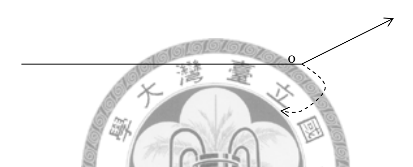
(This diagram is footnote 23 on page 285 in Cinema 2.)

In Cinema 2 , Deleuze further uses a diagram which Bergson thought there was no need to draw to contend how time is constituted by the present, rushing toward the future and the past, preserving in and by itself: